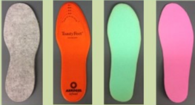
Wool Felt Aerogel Open Cell Closed Cell

Did you know that the human body is excellent at regulating its own temperature? Still, when we exercise or are faced with extreme heat or cold, clothing is essential in helping our bodies maintain a safe temperature – this action is called thermoregulation . One example of this is keeping our bodies warm in cold weather. Insulation is a protective layer that prevents or slows heat loss, helping us stay warm. Materials that have spaces to trap air are better insulators. Some materials you can use are open and closed cell foam. Open cell foam has large air spaces that are not enclosed (like a baby bath sponge). Closed cell foam has smaller, enclosed air pockets (like thin craft foam). Aerogel is a synthetic ultralight material that comes from a modified gel. Wool felt is a compact material made from sheep's wool. In this activity, you will learn to identify the best insulating materials to keep you warm in cold temperatures.